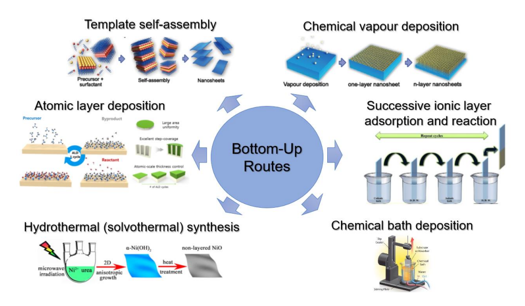
Figure 4 Schematic representation of various "bottom-up" routes.