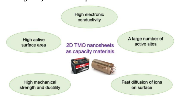
Figure 2 The main advantages of 2D TMO nanosheets, essential for the creation of high-performance capacitive materials.

Following the successful exfoliation of graphene from graphite, many metal oxides with nanosheet morphology have been obtained using a similar approach. This method is not only relatively simple and scalable, but also capable of maintaining a high degree of crystallinity. However, the thickness and transverse size of the nanosheets obtained by this method cannot be controlled. In addition, there are limitations associated with the number of types of delaminated 3D crystals, which greatly limits the scope of this method.